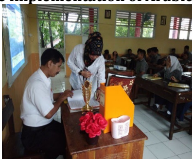
Picture 5. Supervision on the implementation of Arabic language learning

In this approach, instructors feel better aided by academic monitoring and will be able to carry out learning activities correctly (Suradi, 2018).