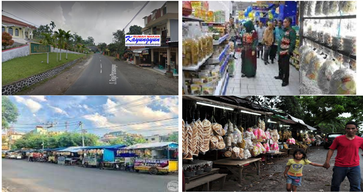
Figure 2: Economic potential of Cinyasag village

products that can be developed by this village. This has not been taken into consideration by regional government policies.