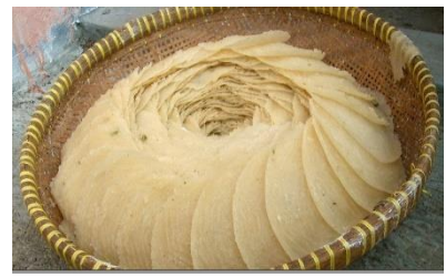
3) drying result ready to bake