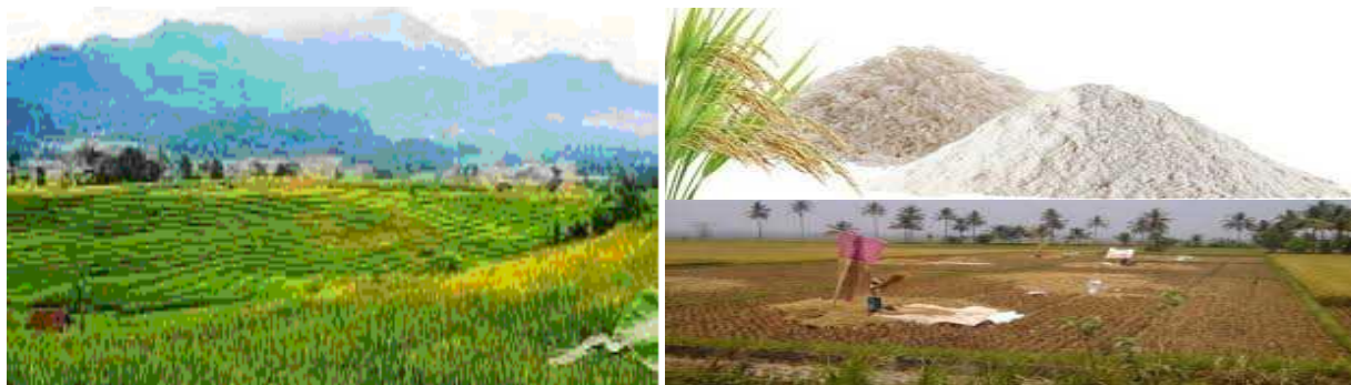
Figure 2: Farming area of Cinyasag potential rice production