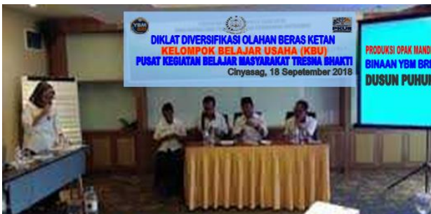
Figure 5: presenter of short course material

In this first stage, participants were given material: (1) insight, knowledge about the development of the industrial economy and business locally, regionally, and internationally; (2) knowledge in the field of industry and independent business based on agricultural products, (4) Processed agricultural production techniques focusing on processed rice (KBU Management Program: Sukaenah, 2019).