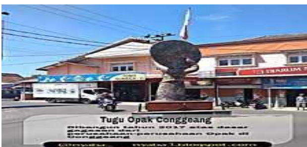
1) monument of OpakConggeang

Comparative study activities (comparison study) are activities carried out by interest groups to visit or meet certain objects that have been prepared and take place in a relatively short time with the aim of comparing the conditions of objects that have already advanced, in order to have a positive effect, because by seeing and studying directly it will be more open insight and intellectual, so that in the future be able to apply the ideal concepts that have been learned in the field of study elsewhere with the conditions that exist in their own place (Setiasih, at., al. 2017). This event was held on September 30, 2018. Departing from Cinyasag at 07.00, arrived at Conggeang at 09. 25, right at the CongaengOpak Monument.