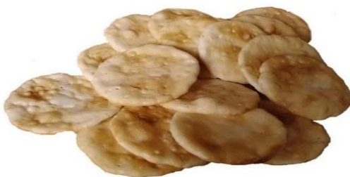
Figure 6: sweet Opaktypical of Cinyasag

Cinyasag'sOpak is typical of two types of sweet and salty. Sweet opaque usually has a large size of about 15-20 cm, has a thickness between 0.5-1.0 cm. While salty opaque is rather small at around □ 8-10 cm, has a thickness of between 1.5 and 2.5 cm. The ratio of magnitude is almost 1: 3 (Role of the Village: Jamaludin, 2019).