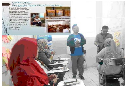
1) figuring out of the Material

The target of the comparative study is Opak Oded ConggeangSumedang UKM located in Conggeang Hamlet RT 01 RW 02 No. 282 ConggeangWetan Village Conggeang District. Upon arrival at the location, we were kindly graciously provided a special room for meetings. For approximately 1 hour we were treated to insights, knowledge, experiences about the journey to develop an opak business. After that we were invited to see and watch the production process, starting printing, baking, packaging and marketing opak (KBU Management Program: Sukaenah, 2019)