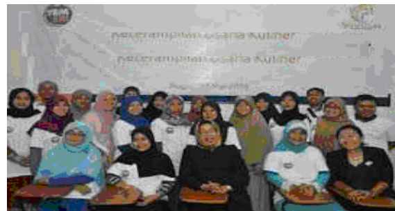
Figure 6: members are doing the test