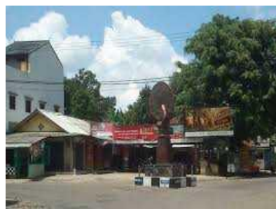
5) location of Opak Odedoutlet