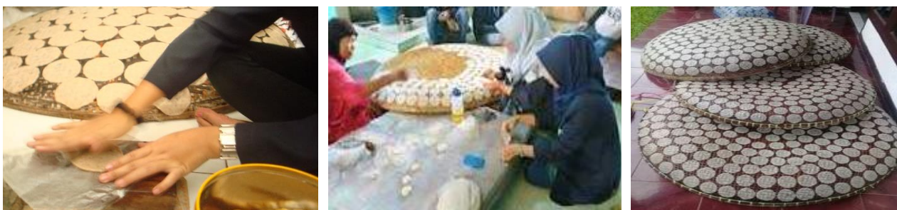
(1) printing the ordering immediately

There are two forms of structuring/attachment activities in large sieves (Cinyasag term). Some do it directly after printing, attached/arranged in a sieve (by the printer itself) (1), and there is also an attachment of opak material resulted from the setting of another person, collected from the printer then pasted (2), and after that then the opak material is ready to be dried in the sun (KBU Management Program: Sukaenah, 2019).