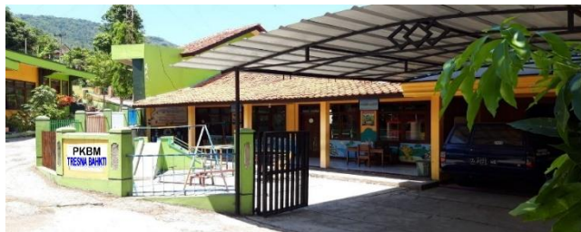
Figure 4: glutinous rice Potential

The skill of processed glutinous rice products is really needed by the woman farmer community in Cinyasag Village, after the women know that glutinous rice has high economic value potential. However, they have not been touched by the education and training program in the diversification of the food processing industry from agricultural products (Village Role: Jamaludin, 2019).