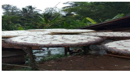
1) drying phase I