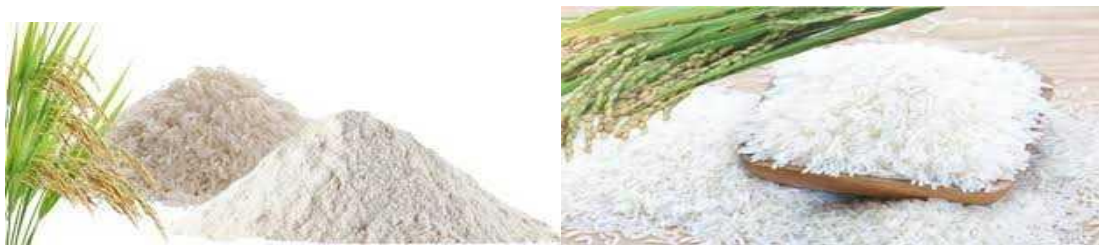
Figure 5: glutinous rice in red and white types

Sticky rice contains mainly starch component, amylopectin. Glutinous rice has a more fragile texture, large grain and white color (Darmajati, 1981 in Ridwan, 1994). The chemical structure of branched amylopectin causes a stronger shape and low amylose content and sticky rice tends to produce more brittle opak products. Amylose and amylopectin levels can be divided into waxy rice (glutinous rice) containing 1-2% amylose and non-waxy rice (low amylose 10-20%, moderate 20-25%, and high 25-30%) (Isyanti, M. & Lestari, N. 2014).