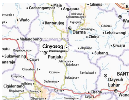
Map of Ciamis regency (Cinyasag village of Panawangan district)