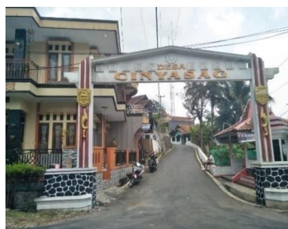
Entrance gate of the village Cinyasag village of Panawangan district Ciamis Regency