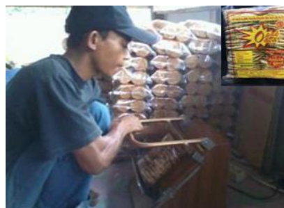
4) Opak Oded packaging