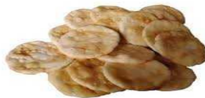
Gambar 7: Salty Opaktypical of Cinyasag