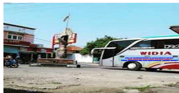
2) the Groups arrive in Conggeang