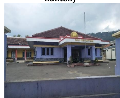
Public hall of Cinyasag Panawangan district Ciamis Regency