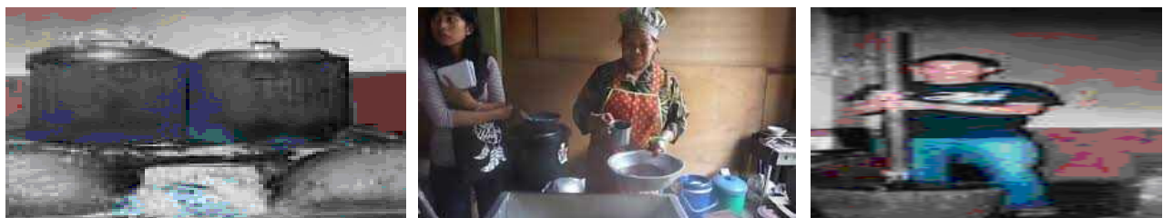
Figure 10: the process of steaming and pounding

After the material is prepared, steaming is done within a certain time, after which the collision process is assisted by male participants.