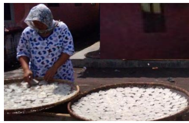
2) drying phase II