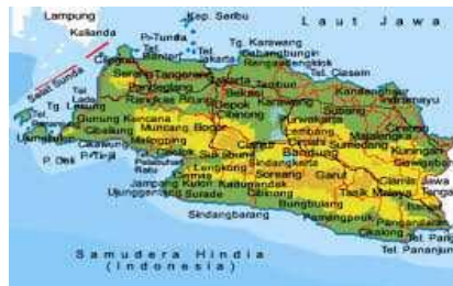
Map of West Java and Banten Indonesia