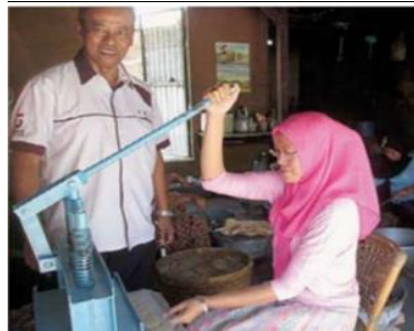
2) printing of Opak Oded