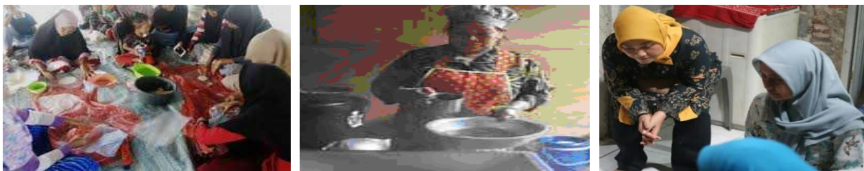
Figure 9: preparing the materials before steaming

Participants practiced the preparation of materials, steaming, guided by Ms. Nani, an expert from the Sumedang, and the collision was assisted by male participants. After that, it follows the practice of printing.