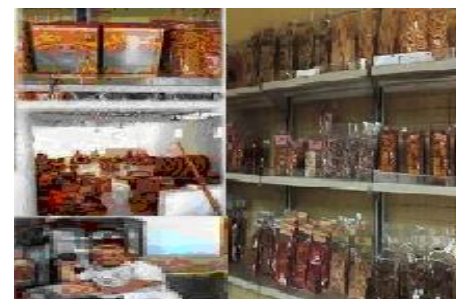
6) situation in the Opak Oded Outlet