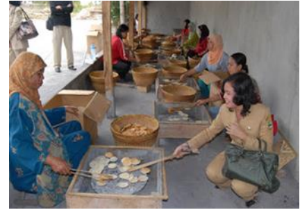
3) baking of Opak Oded