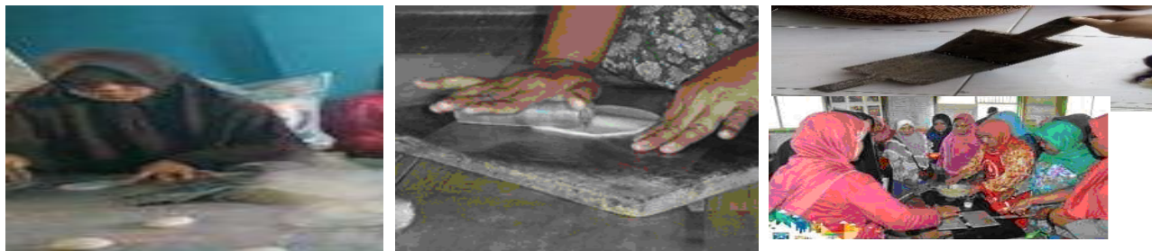
(1) Neplak Opak