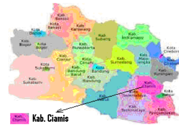
Map of West Java (after being separated from Banten)