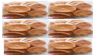
3) Opak are ready for marketing