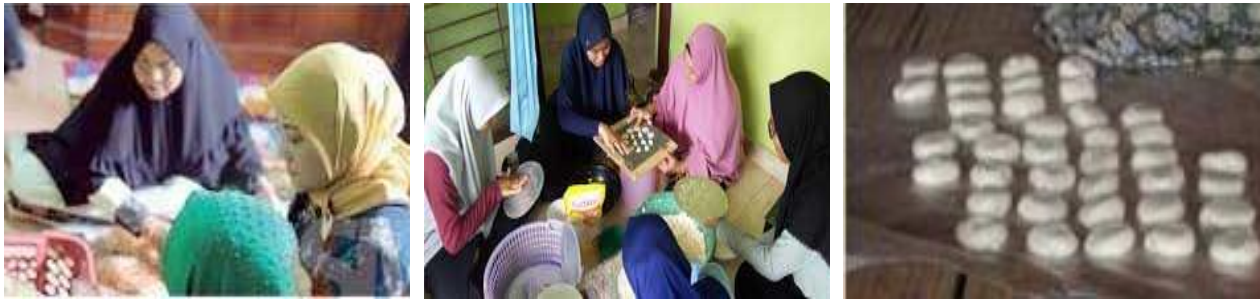
Figure 11: The process of Janggal forming

During this time in Cinyasag, there were three ways of printing the term Cinyasag: (1) NeplakOpak (working directly by hand). (2) NgagerelengOpak (working with wooden shaking tools); (3) NgajokplokOpak, doing opak printing using a wooden clamp called Jajaplokbby Cinyasagpeople, (similar to Egrol cake printing) (KBU Management Program: Sukaenah, 2019).