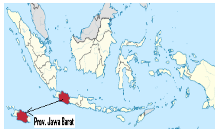
Map of Indonesia

making it possible to develop commodities and diversify agribusiness-based food crops and horticulture. The area is 497 Ha. The population is 4,600 people, density is 1/1000 m. Located in the area of Ciamis Regency with 244,369 hectares. population of 1,774,032 people, growth rate of 0.84 percent per year (Munawar, at.al., 2017). The carrying capacity of a strategic geographical location has a quite positive impact on the development of various types of superior plants. Ciamis Regency has a mainstay area with superior products that are well known nationally and internationally, namely rice plants, one of its production centers is in Cinyasag, Panawangan District. Growing lowland rice is ingrained for most farmers in Indonesia. (BPS. Kab. Ciamis, 2018).