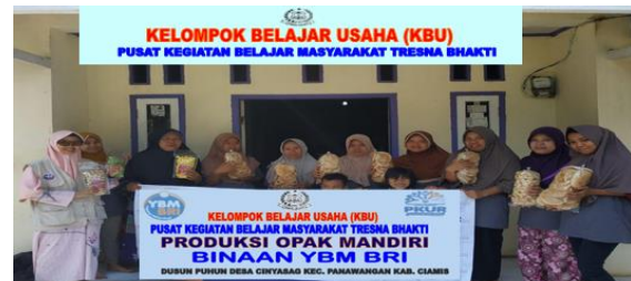
Figure 5: Learning enterprise group