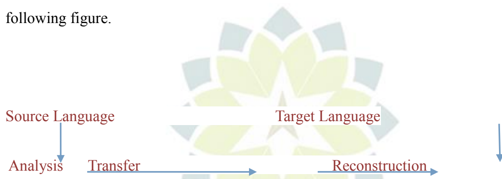
Figure 1.2 Nida and Taber's Translation Process

According to Djuharie (Nida and Taber, 1969:33), the translation process is divided into three phases: 1) analysis; this is the step of analyzing the source language through linguistic and meaning study, the analysis of the material which is translated and cultural problem, 2) transfer; the analyzed materials are transferred in the translator's mind from SL into TL, and 3) reconstruction; the translator rewrites or expresses the translated text until it became a readable and acceptable translation product in terms of rules and styles of TL. The explanation will be described in the following figure.