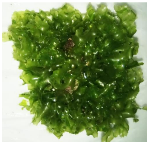
Figure 2. Species of Ulva lactuca in the intertidal zone, Karang Papak, West Java, Indonesia