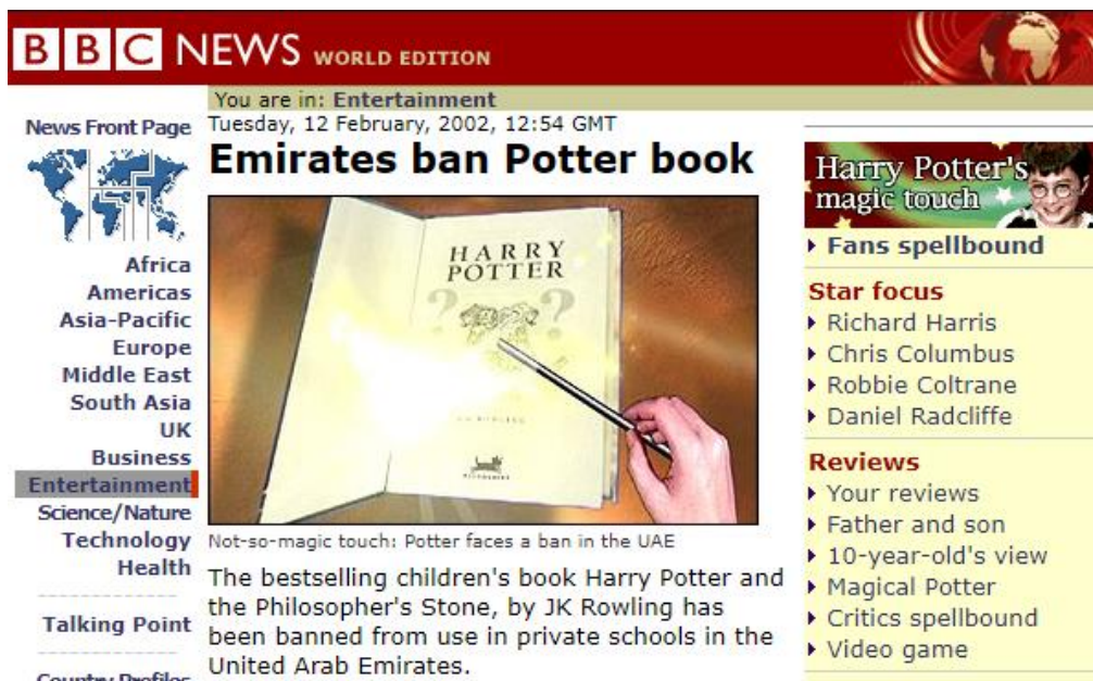
Figure 2 BBC News

Harry Potter and the Sorcerer's Stone and all the rest of the series are part of popular literature, since the books are world-wide popular works – that produced massively for the mass and gained its popularity – it has been read by millions of people, from kids to adults, in many countries with the various background of cultures, traditions, beliefs, and religions. So, it will create different impacts to each reader depending on how the readers take it for themselves. Regarding to it, those who against the materials or contents of this novel believe that Harry Potter books must be banned to read, especially by children. The issues were reported by several news media. For instance, this news from BBC News: