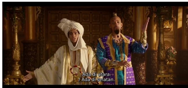
Figure 12. Aladdin and Genie

The pacing scene in Beauty and the Beast (2017) movie can be seen in the scene when Gaston and his entourage force their way into the palace to kill the Beast, but Beast's servants who are living stuff try to fight back by attacking everyone there. This scene is particularly thrilling because it is the climax of the story but changes to humor comes from people who lose to living stuff.