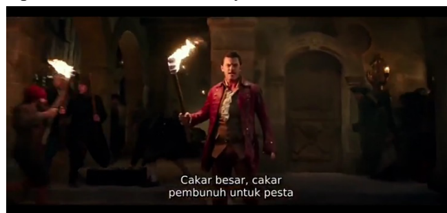
Figure 7. Gaston when going to attack the Beast castle

In figure 7, the scene shows that Gaston is influencing people to go to the palace to kill the Beast. He mentioned that Beast were cruel creatures that would threaten the lives of people there. Finally everyone went to the palace with sharp weapons, but that same night Belle managed to escape from Gaston's custody and went to rescue Beast to the palace.