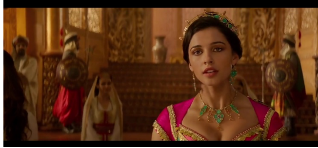
Figure 4. Jasmine

Jasmine is the daughter of the sultan of Agrabah Kingdom, she is the only child. She fell in love with Aladdin as a young man from the common people. She is very beautiful, smart and has a tall body. Her mother had died because she was killed while walking outside the palace. Thus Jasmine was not allowed to leave the palace by Baba (Sultan Agrabah, Jasmine's father). Jasmine has a caring nature for her people. Jasmine also has a brave nature she dares to change the laws of the kingdom.