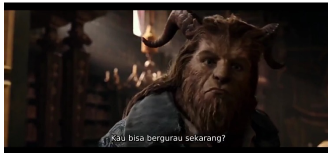
Figure 2. Beast

The second one is Beast. In the past, Beast was a handsome prince, but he grew up to be a proud and selfish young man until he was cursed to become an ugly man who was imprisoned in his castle. Beast must learn to love others sincerely and share kindness with others. To break the curse, Beast must find his true love, which is someone who can see the goodness in him regardless of appearance.