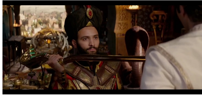
Figure 8. Jafar when threatening

In figure 8, the scene shows Jafar forcing Aladdin to admit that his servant is the Genie from inside the magic lamp. Jafar threatened Aladdin to push him into the sea if he wasn't honest, but Aladdin still claimed that he was a prince, after that Jafar pushed him into the sea until Aladdin drowned, but luckily the genie from inside the magic lamp came out because of the friction of Aladdin's hand. The genie looked for every way to save Aladdin, then Aladdin survived and came to Jafar.