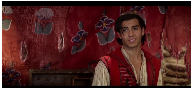
Figure 3. Aladdin

Aladdin is an orphan who has been abandoned by his parents since he was a child, he lives neglected and lives in a former tower with a monkey named Abu. Aladdin has a habit of stealing to meet the necessities of his life. But actually, Aladdin is a character who is kind, generous, not greedy and does not break his promise to his words. He stole because circumstances required him to steal so he could eat.