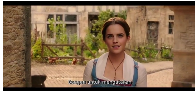
Figure 1. Belle