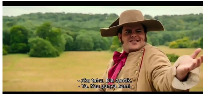
Figure 5. LeFou

Complex Character in Beauty and the Beast (2017) is LeFou, a loyal guard of Gaston, the antagonist in the story. LeFou is a new character made more feminine than the animated version. He was a man who was shy and disinclined of his master Gaston. But at the end of the story, he sided with the truth and helped the prince's followers.