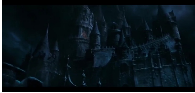
Figure 9. The cursed castle

Beauty and the Beast (2019) is set in a small town in France. The town is quite calm and comfortable for its residents. But deep in the forest there is a castle that is abandoned as if without an inhabitant. The palace was cursed and forgotten by everyone. Inside was a handsome prince who was cursed to become a Beast and some of his servants who were cursed to become things, of course they were all alive. This magical thing that shows the fantasy genre in this movie.