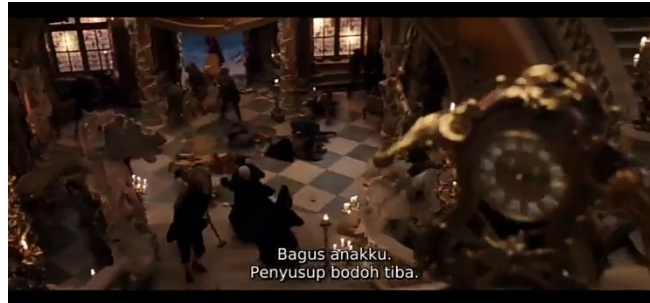
Figure 11. Fight in the castle

long story or watching a movie. Slow stories usually appeal to an older audience, while fast stories appeal to younger audience. Writers usually cut out extra words that are not important. Pacing is used to keep stories that are made quickly to avoid boredom, and made slow to pay more attention to detail. However, in the fantasy genre pacing is a shift from a tense atmosphere to an atmosphere of humor. As in the book Saricks it is said that humorous fantasy often moves more quickly from the first pages, or at least seems to do so, as it sucks readers in with the lavish wordplay (Saricks, 2009).