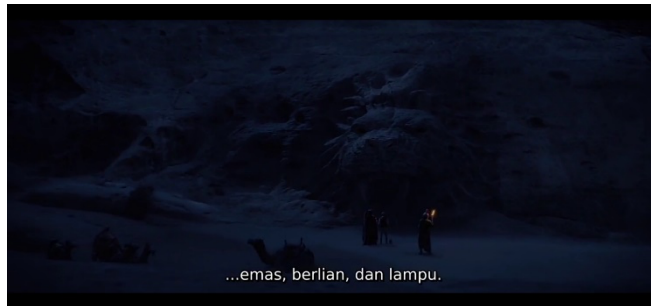
Figure 10. Magic cave

Beauty and the Beast (2019) is set in a small town in France. The town is quite calm and comfortable for its residents. But deep in the forest there is a castle that is abandoned as if without an inhabitant. The palace was cursed and forgotten by everyone. Inside was a handsome prince who was cursed to become a Beast and some of his servants who were cursed to become things, of course they were all alive. This magical thing that shows the fantasy genre in this movie.