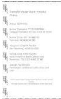
bukti tf biaya tambahan publikasi beei 2020.jpeg 110K