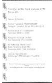
Bukti Tf Publikasi BEEI.jpeg 109K