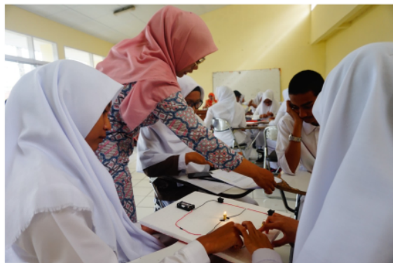
Figure 3. Teacher Activities

make estimates and interpretations based on appropriate proportions.