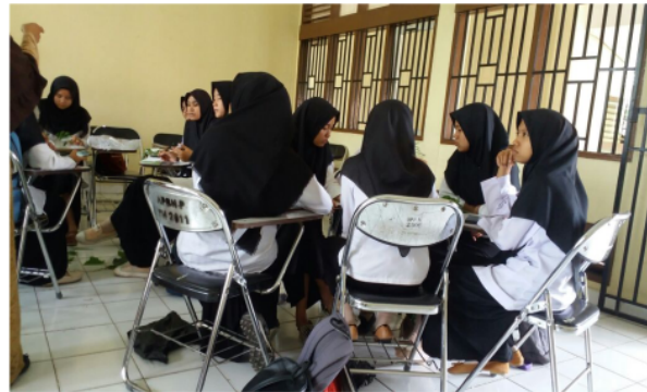
Figure 2. Student Activities

obtained, how to conclude from the available premises, and conclusions based on specific inference rules—a broader form of activity than the ability to think logically in solving problems sensibly. According to Sumarno, et al., (2012) and Fardiana, et al., (2019), the ability to think logically includes the ability to: (1) draw conclusions or make estimates and interpretations based on appropriate proportions, (2) draw conclusions or make estimates and predictions based on opportunities, (3) Draw conclusions or make estimates or predictions based on a correlation between two variables, (4) Determine the combination of several variables, (5) Analogy to draw conclusions based on the similarity of the two processes, (6) Doing evidence, (7) Prepare analysis and synthesis of several cases. Seven indicators can be simplified into (Hidayat & Sumarmo, 2011; Bakhy et al., 2018): (a) conclude analogies, generalizations, and constructing conjectures, (b) draw logical conclusions based on the rules of inference, checking the validity of arguments, and compiling valid arguments, (c) compiling direct or indirect evidence.