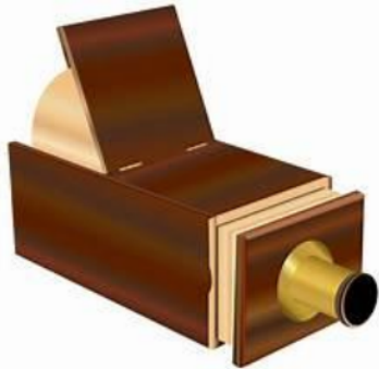
Figure 2 Camera Obscura Illustration

everyone's mobility and accessibility. Camera access is also currently accessible digital, even via smartphones. Smartphones currently supported by increasingly sophisticated camera facilities provide camera quality with excellent resolution according to the needs of the users of the smartphone. Cameras can document various kinds of important events or momentum so that they can be stored and also viewed again at a later date. For now, the camera can support the creation of different content that can be used as a source of information in the form of illustrations that can clarify the delivery of information as a form of visual communication (Vigoroso et al., 2020). The development of the era is increasingly rapidly showing an unstoppable level so that various technologies compete with each other in creating the best camera technology. Whether it is in terms of design or technology, this cannot be separated from historical discoveries in the past related to technological discoveries. Muslim scientists, namely Ibn al-Haitham, pioneered the camera and the invention of camera technology.