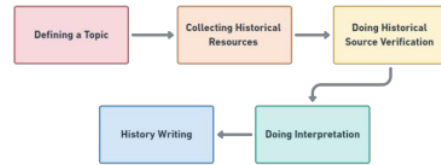
Figure 1 Stages and Steps of Historical Research

The research method used in writing is the historical research method. Historical research is research that aims to be able to understand and interpret events in the past to reach an understanding of insights and conclusions related to events in the past. The data source used is secondary data obtained from reference sources in the form of references in the form of articles from previous scientific research following the topics studied and by analyzing other historical sources, and literature reviews (Xiao & Watson, 2017)