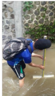
Figure 2. Data withdrawal.