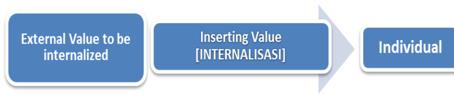
Figure 1 Fundamental of Internalisation

The process of internalization can be done through socialization: Socialization is the total process in which individual develops a human personality and learn to be a social actor. (Syamsul Arifin, 2011:38 or may be internalized through techniques of clarification. (Lisievi & Andronie, 2016)