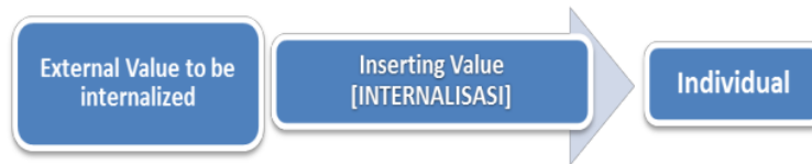
Figure 1 Fundamental of Internalisation

The process of internalization can be done through socialization: Socialization is the total process in which individual develops a human personality and learn to be a social actor. (Syamsul Arifin, 2011:38 or may be internalized through techniques of clarification. (Lisievici & Andronie 2016)